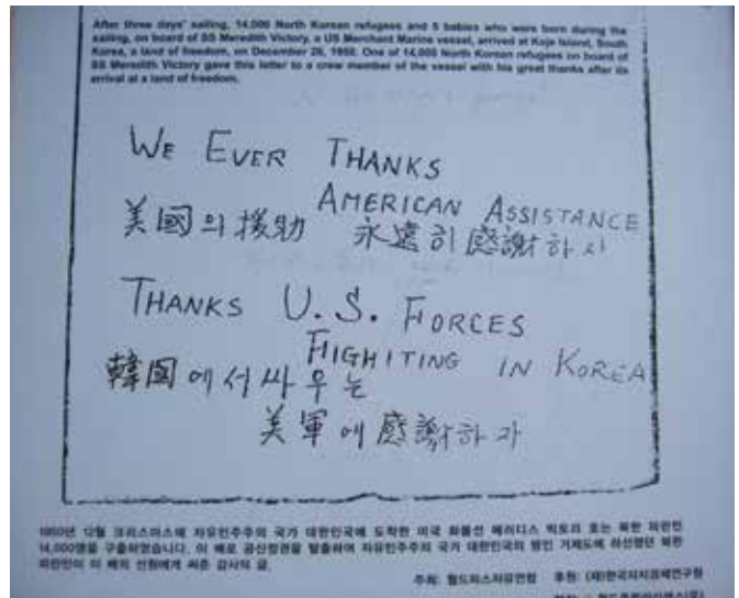
A note given to a crew member by a grateful refugee

Conditions were so crowded that most of the refugees were forced to stand, in freezing conditions and with little food or water, for the three-day voyage. Yet there were no fatalities or injuries. In fact, the number of passengers actually increased en route: five babies were born on the main deck! All were delivered with the help of First Mate D.S. Savastio, with nothing more than basic first aid training. And compassion.