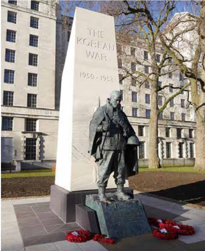
New Korean War Memorial, London

On December 3, 2014, a new Memorial to the UK's Korean War veterans was commemorated at a ceremony in Central London. Britain's Korean War Memorial, a gift from the Republic of Korea to honor the British troops who served in the conflict, was unveiled outside the Ministry of Defence building on Victoria Embankment.