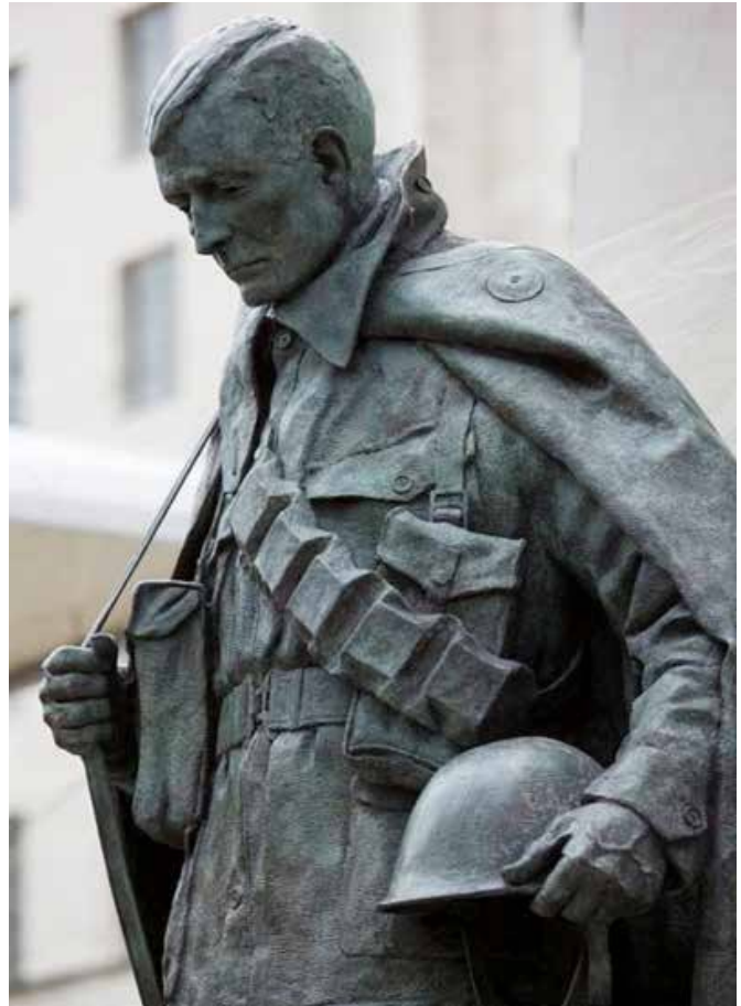
A closer view of the statue