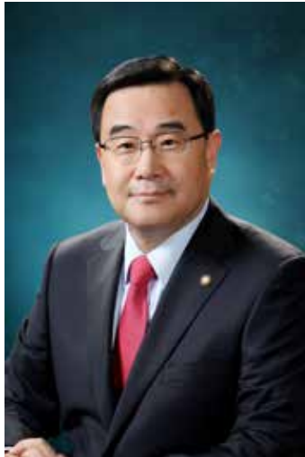
Representative Kim Jong-hoon

Representative Kim Jung-hoon is a three-term member of the Republic of Korea's National Assembly. He was first elected in 2004 to represent Nam-gu District in Busan, and reelected in the general elections of 2008 and 2012. He also served a term as Chairman of the National Policy Committee of the 19th National Assembly, a term that ended in June, 2014. This key standing committee oversees the Prime Minister's Office, the Ministry of Patriots and Veterans' Affairs, the Finance Supervisory Commission, and the Fair Trade Commission.