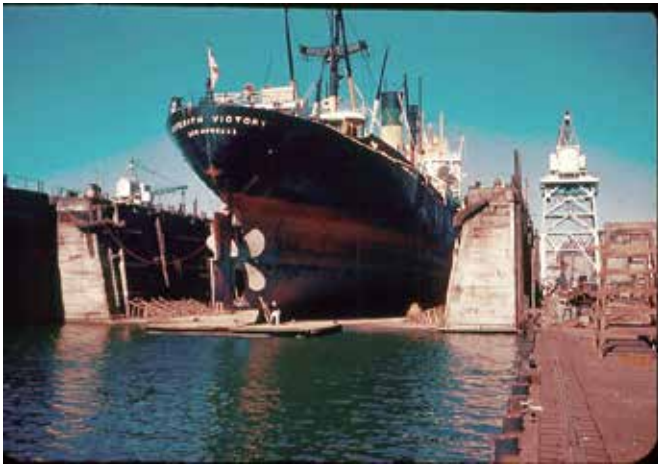
The SS Meredith Victory toward the end of her proud service

In 1960, the SS Meredith Victory was conferred the title of “Galant Ship” by a special Act of Congress signed by President Dwight D. Eisenhower. The U.S. Department of Transportation declared her miraculous voyage as “the greatest rescue in the history of mankind.” The Guinness Book of World Records describes it as “the largest evacuation from land by a single ship.”