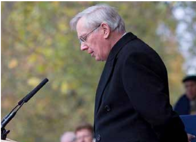
HRH the Duke of Gloucester

Over 500 guests, including 320 Korean War veterans, watched as His Royal Highness the Duke of Gloucester delivered a message from the Queen. Other dignitaries participating included British Defence Secretary the Rt Hon Michael Fallon MP, and the Republic of Korea's Minister of Foreign Affairs, Mr. Yun Byung-se.