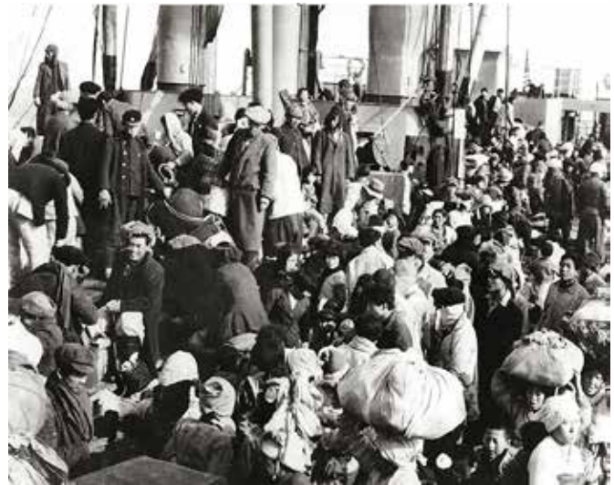
Korean refugees on the main deck

escort or means of self-defense. Numerous other ships evacuated the rest of the refugees, but no ship carried anywhere near as many in one voyage as the Meredith Victory.