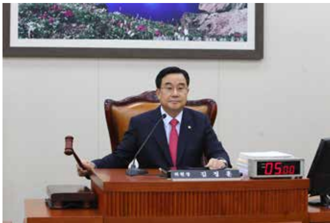
Representative Kim chairing a National Policy Committee meeting in 2013

In 2009, Representative Kim attended the 64th General Assembly of the United Nations, where he made a persuasive appeal to UN Secretary-General Ban Ki-moon about the historical and moral importance of the UN Memorial Cemetery, located in his home district of Nam-gu. The following year, his appeal resulted in the UN designation of Nam-gu as a Special Peace and Culture Zone of the United Nations, the only such zone in the world.