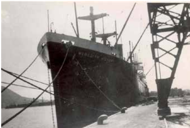
The SS Meredith Victory at the time of the evacuation