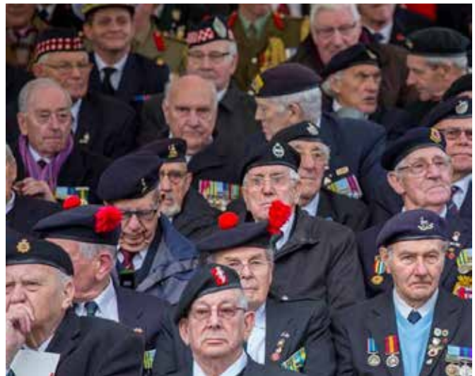
Korean War veterans at the unveiling