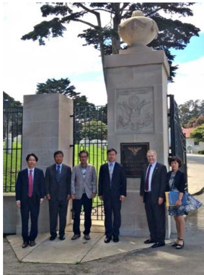
At the entrance to the National Cemetery