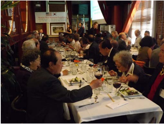
The guests enjoying the food and music

On June 25, the 64th Anniversary of the start of the Korean War, the Korean War Veterans Appreciation Dinner was once again held at the Golden Gate Grill in San Francisco. Close to 150 people, including 60 Korean War veterans and their spouses and guests, attended the festive event sponsored by the Korean War Memorial Foundation (KWMF). Good food, wine, and conversation; the renewal of old friendships and the beginning of new ones; and first-rate live musical entertainment all contributed to a very memorable evening.