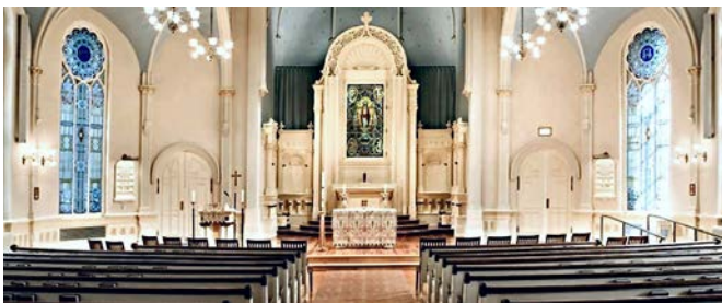
St Mark's Lutheran Church, San Francisco