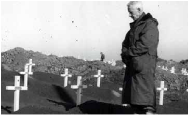
Major General O.P. Smith, USMC, Commanding General, 1st Marine Division, at U.S. Cemetery, Hungnam, North Korea, December, 1950

HELP US GET THE JOB DONE MAKE A DONATION TODAY