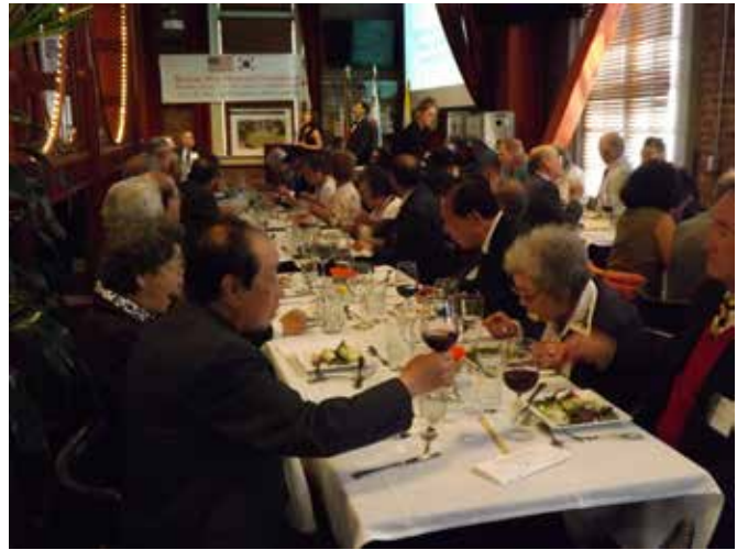
Korean War Veterans Appreciation Dinner