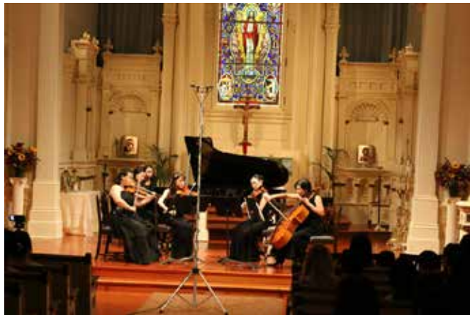
Ensemble Ari in performance

Saturday, October 18, 2014 was a very special evening for our Foundation. At St. Mark's Lutheran Church in San Francisco, Ensemble Ari, a Bay Area group of classically-trained Korean musicians, presented a concert on behalf of KWMF. The musicians did not accept any payment for their work, and all the income from the concert was donated to KWMF.