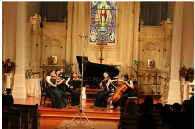
Ensemble Ari performing "Remembrance" for the Korean War Memorial