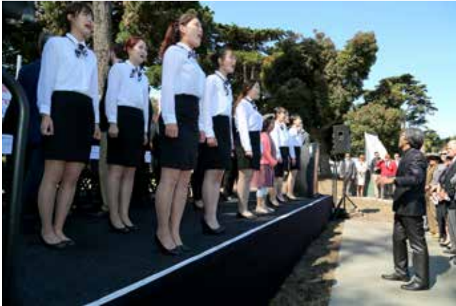
Students Singing the Korean National Anthem

The ceremony began with the Star-Spangled Banner. This was followed by the Korean National Anthem, sung by a group of young Korean students from Kyungbuk College who are currently in the Bay Area on a summer exchange program.