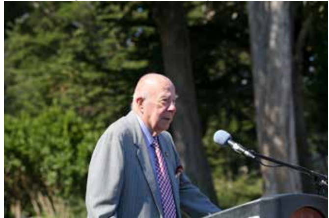
Former Secretary of State George P. Shultz

Marines in the audience. He then spoke of the long, close relationship between the United States and the Republic of Korea, and of the many memorable visits he made to Korea during his tenure as Secretary of State.