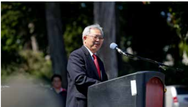
San Francisco Mayor Edwin M. Lee

San Francisco Mayor Edwin M. Lee then spoke of “the long-awaited Groundbreaking at this wonderful site,” and added that “We in San Francisco will always remember the Americans who fought in the so-called Forgotten