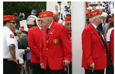
Members of the Marine Corps League in their distinctive red caps and blazers. They and members of the Marine Corps Coordinating Council came from all over the Bay Area to volunteer as ushers and guides, and to assist fellow veterans with disabilities.