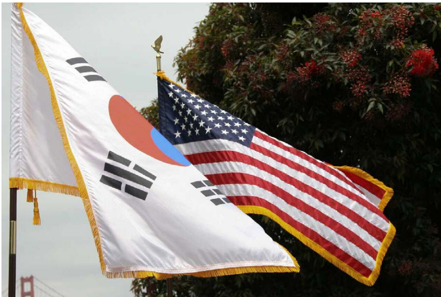
The closest of allies for sixty-six years

We at the Korean War Memorial Foundation wish to express our deep gratitude to the hundreds of individuals and organizations that made this Opening Ceremony—and this Memorial—possible. You are all now part of the Korean War Memorial. Thanks to you, it will no longer be the Forgotten War.