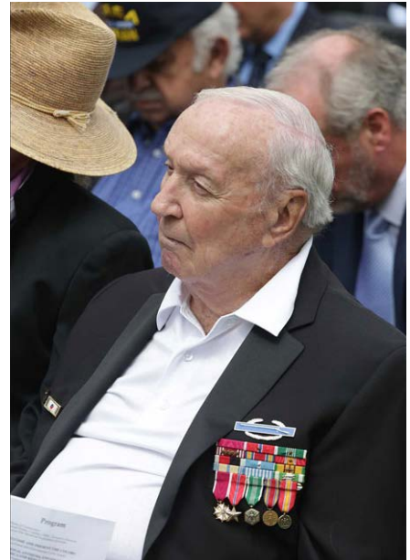
Proudly wearing his Combat Infantryman's Badge and many medals and ribbons