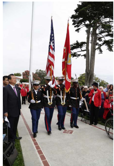
The Color Guard presents the Colors.