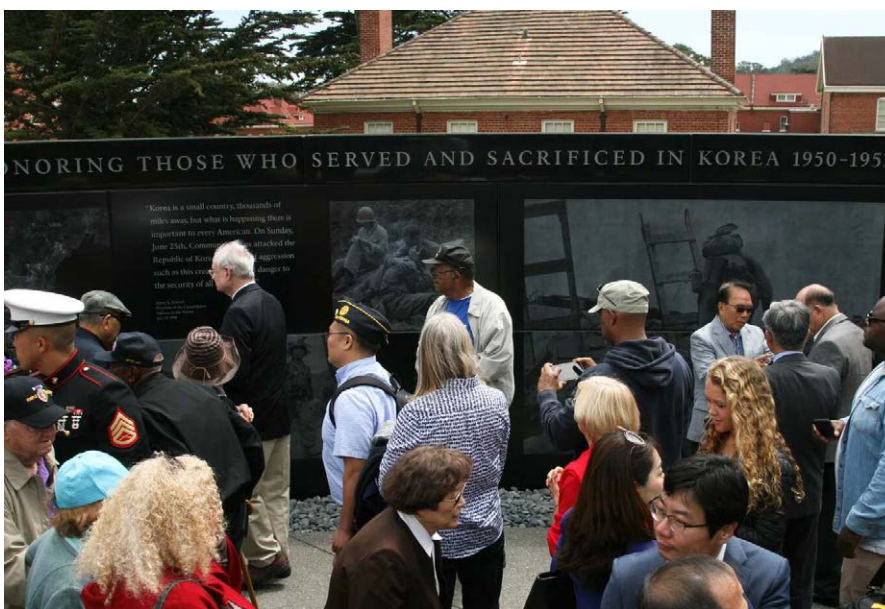
The guests get their first look at the new Memorial.