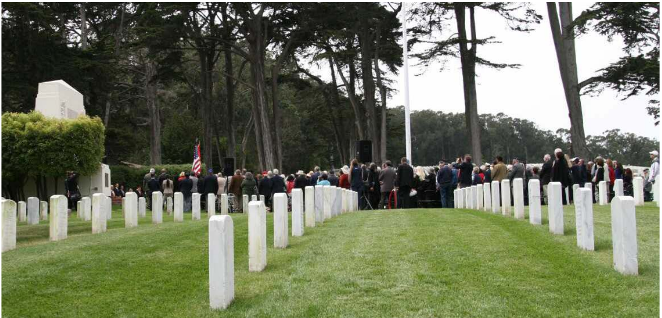
Just a few of the more than 32,000 tombstones in the San Francisco National Cemetery, including 2,273 marking the graves of Americans who fought in the Korean War. The cemetery is right next to the Korean War Memorial site.