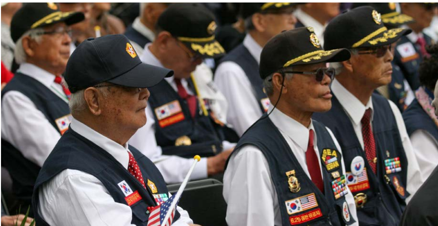
Many Korean veterans of the war were prominent at the ceremony.