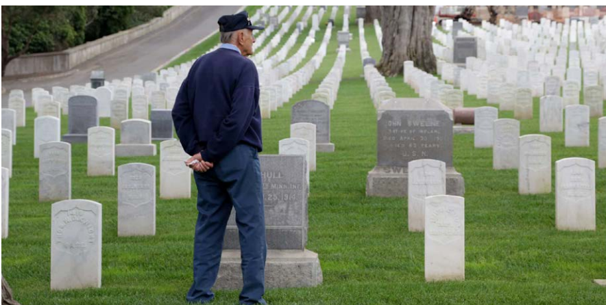
A Korean War veteran contemplates the tombstones, every one of which has its story to tell.