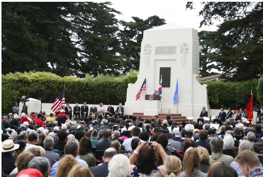
The Rostrum, San Francisco National Cemetery, where the Opening Ceremony began. Approximately 1,000 guests attended the ceremony.