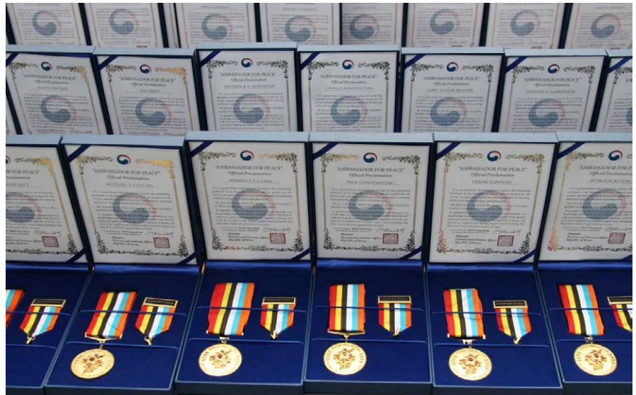
The Ambassador for Peace Medals. In all, 50 were presented to American veterans of the Korean War at the Opening Ceremony.