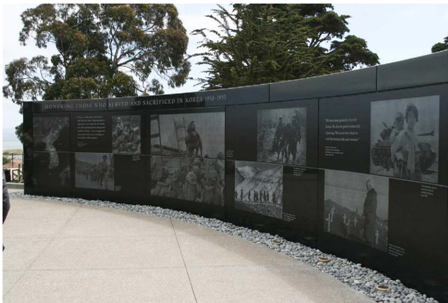
An understated yet strikingly beautiful Memorial for the ages, dedicated to all who fought for freedom in the Korean War