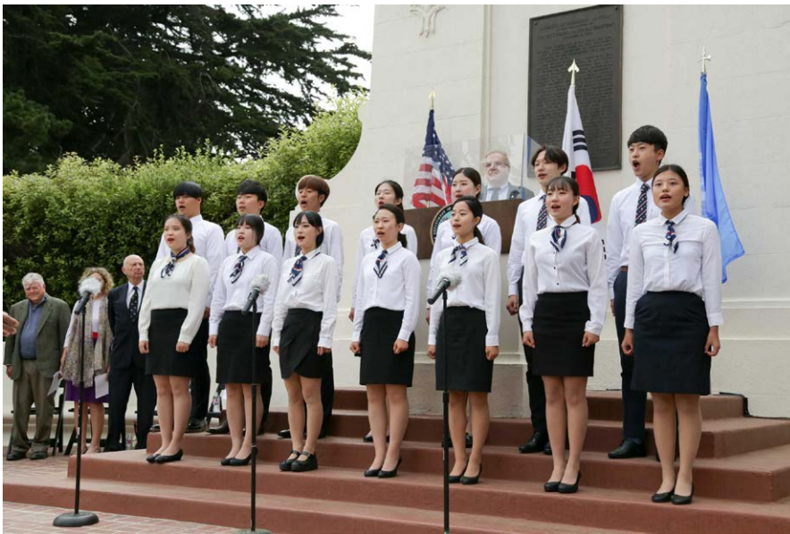
The Kyungbuk College Student Chorus sings the National Anthem of the Republic of Korea.