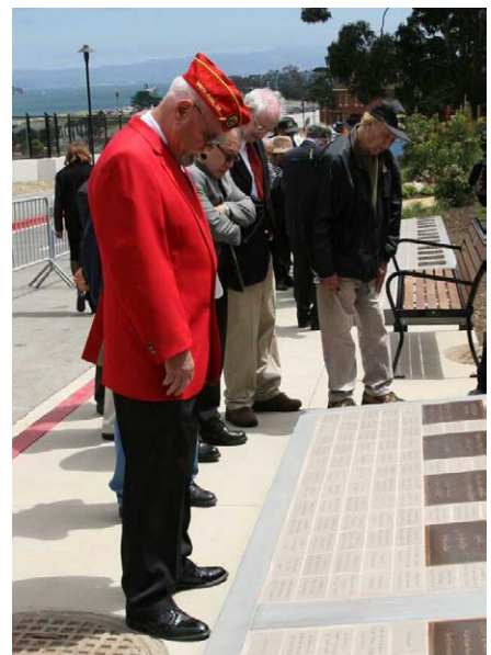
Guests reading the inscriptions on the tiles and plaques in front of the Memorial