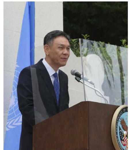
Choi Wan Keun, Vice Minister of Patriots and Veterans Affairs, Republic of Korea, addresses the guests.