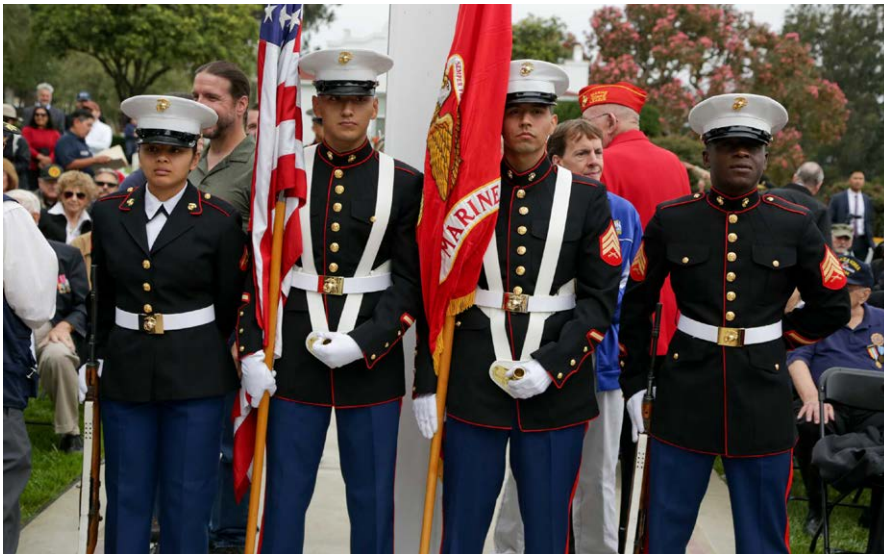
The 23rd Marines Color Guard prepares to present the Colors.