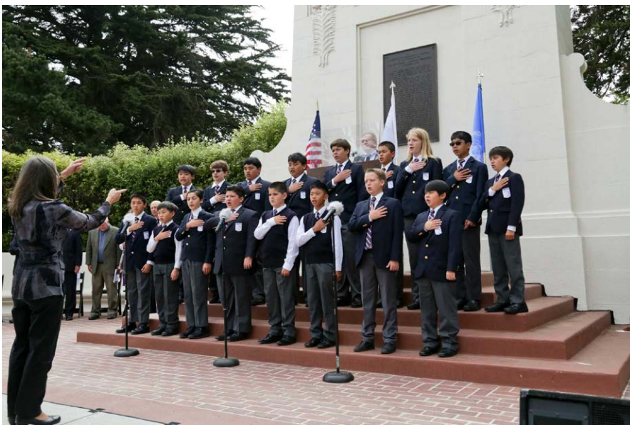
The San Francisco Boys Chorus sings the National Anthem of the United States of America.