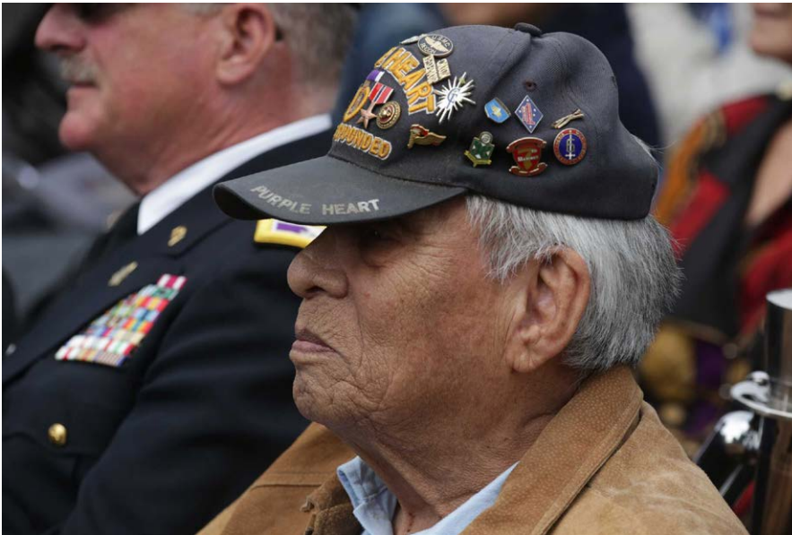
Purple Heart recipient