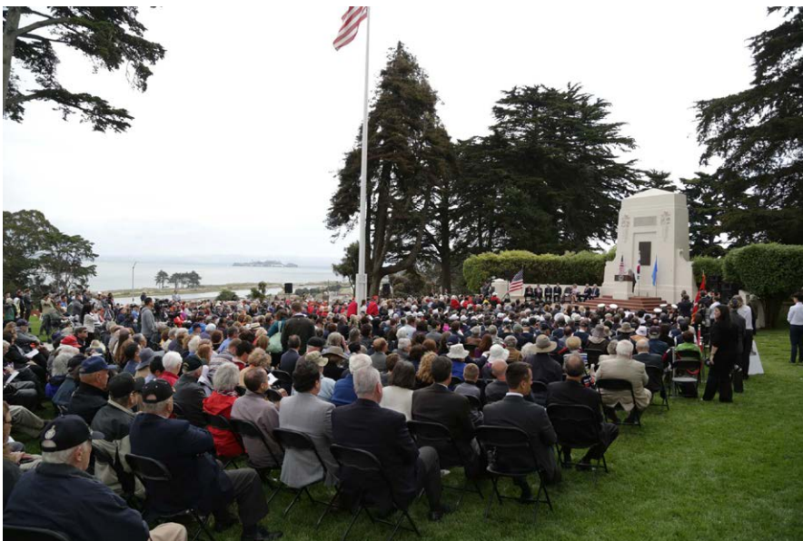
A view of the Rostrum from behind the audience. Just visible in the foggy distance is Alcatraz Island.