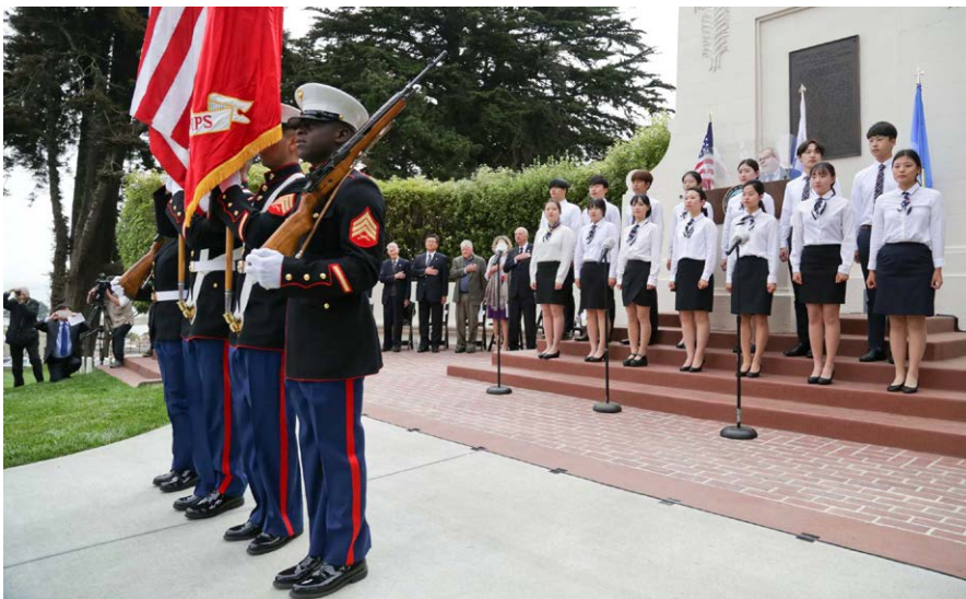
The 23rd Marines Color Guard and the Kyungbuk College Student Chorus