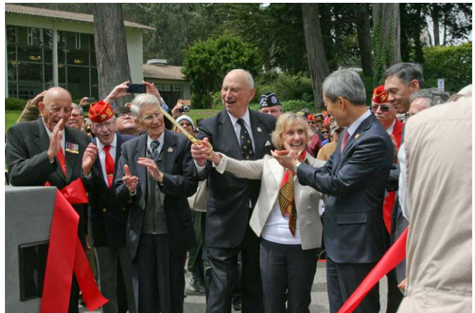
The Memorial is officially open!