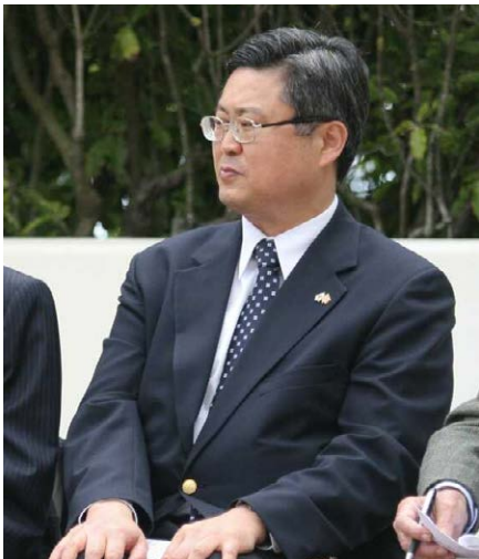
Consul General Shin Chae-Hyun, Consulate General of the Republic of Korea, San Francisco