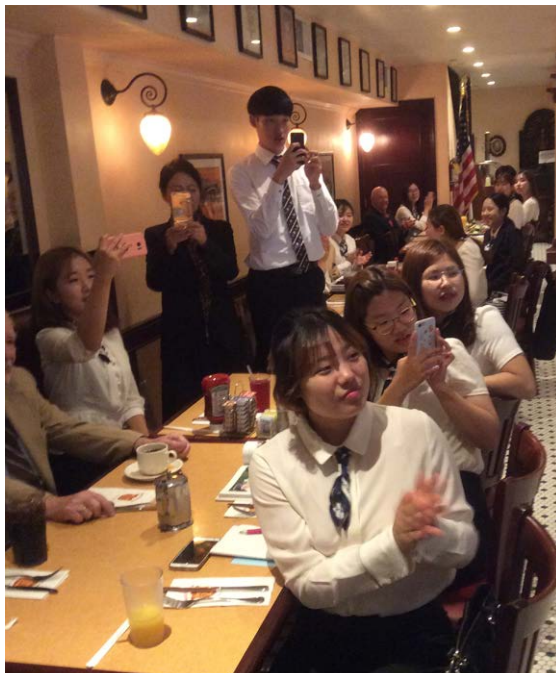
The students listen to the veterans’ “Arirang” duet