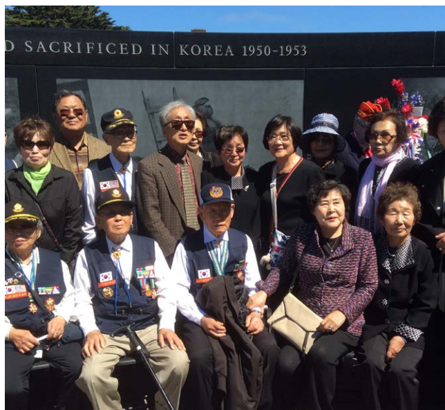
Members of the loyal and supportive Korean-American community