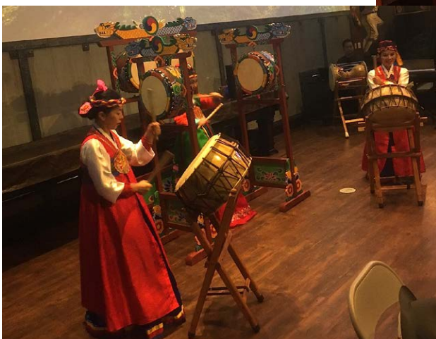
Korean drummers.