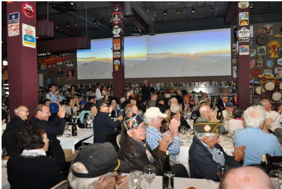
An appreciative audience.