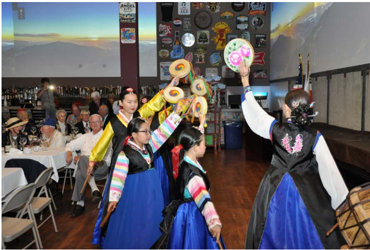
The young generation of Korean dancers.