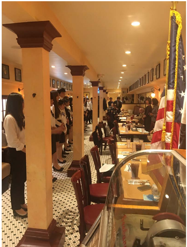
The students sing “Arirang” for the veterans.