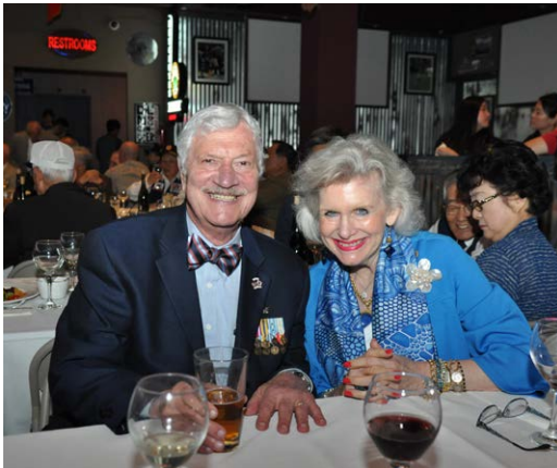
A Korean War veteran and his bride enjoying the evening.