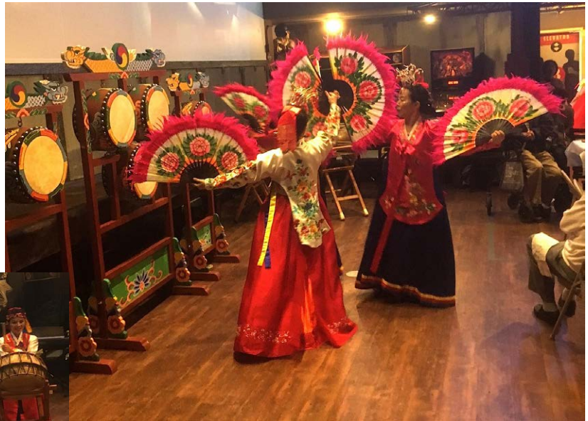
Korean fan dancers in traditional garb.