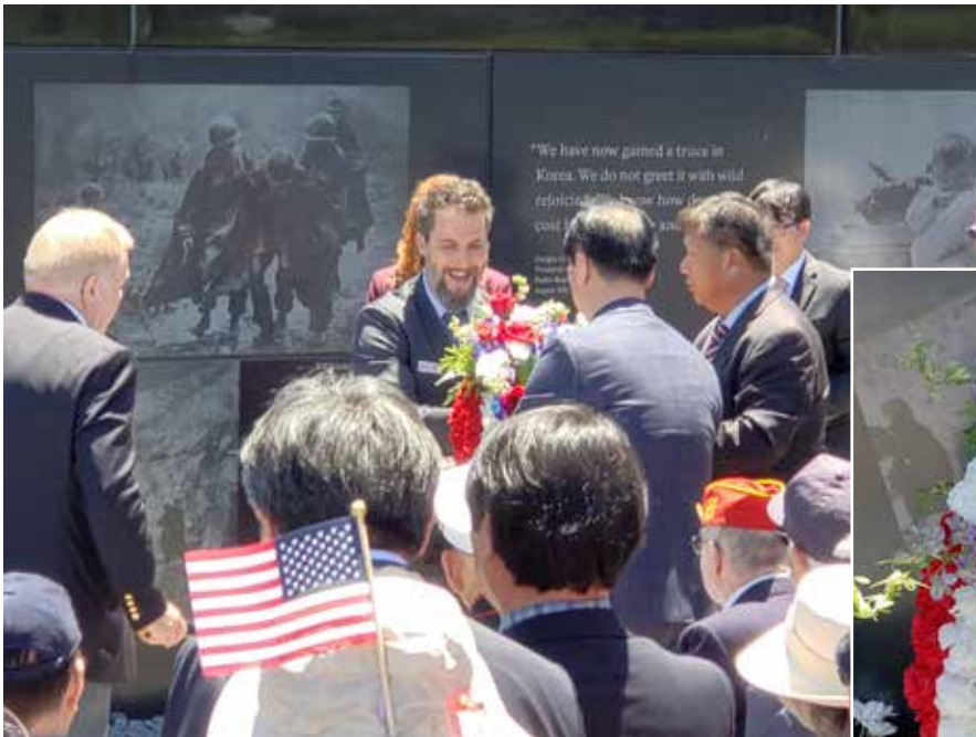
Placing the wreath at the wall