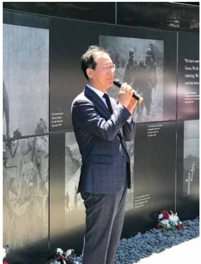
Consul General Park Joon-yong speaks on behalf of the Government of the Republic of Korea