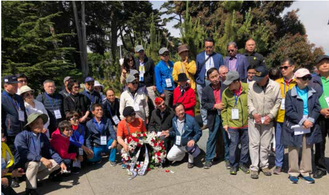
Some of the Korean ROTC officers pose for a group photo

In late May, we at KWMF were pleasantly surprised to learn that we were to have an unexpected visit from members of an association of former Republic of Korea ROTC military officers. They were in San Francisco for their association's annual reunion, coming together from South Korea as well as from local chapters of their ROTC association here in the United States. And on Sunday, May 27, they showed up at the Korean War Memorial for an informal tour: several busloads of them!